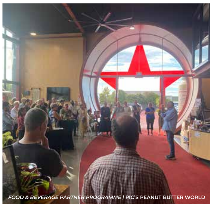
FOOD & BEVERAGE PARTNER PROGRAMME / PIC'S PEANUT BUTTER WORLD