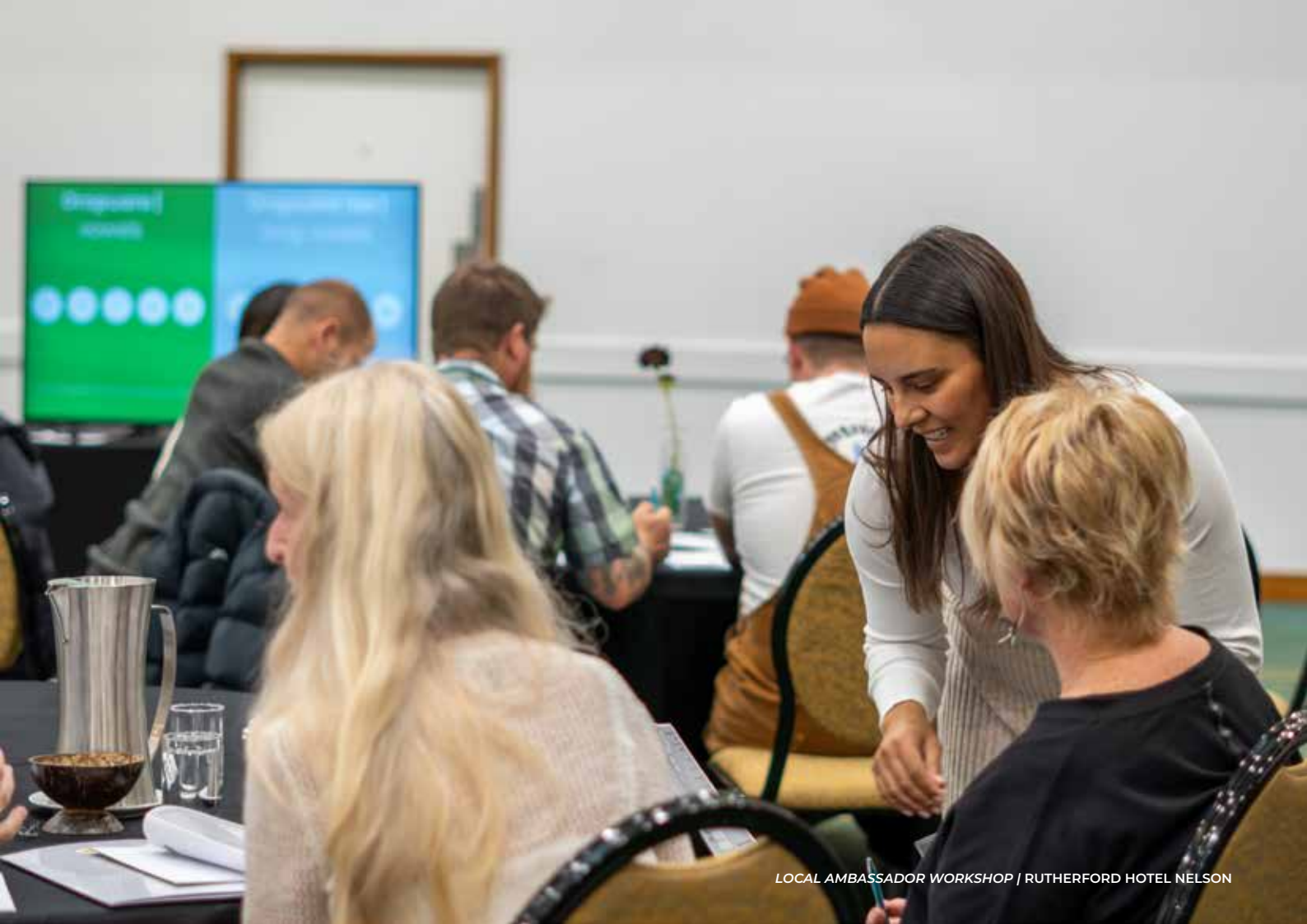
LOCAL AMBASSADOR WORKSHOP / RUTHERFORD HOTEL NELSON