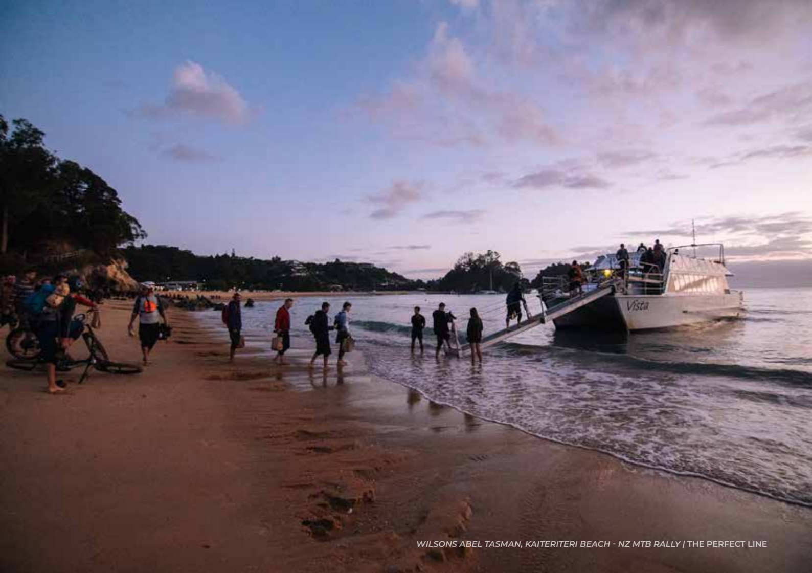
WILSONS ABEL TASMAN, KAITERITERI BEACH - NZ MTB RALLY | THE PERFECT LINE