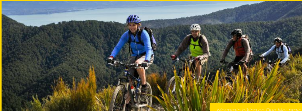
Mountain biking on Dun Mountain