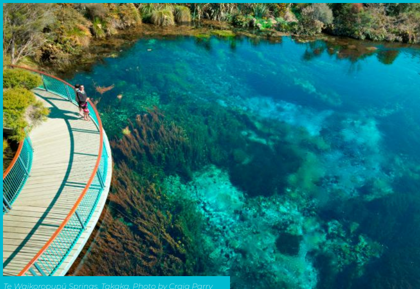
Te Waikoropupū Springs, Takaka, Photo by Craig Parry