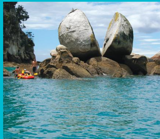
Tokangawhā/Split Apple Rock, Kaiteiteri

Everyone knows that Nelson Tasman is sunny, with consistently high sunshine hours all year around – about 30% more than the national average. But it's the crisp, clear days of autumn that locals love, where there is snow on the mountains yet the sea is still warm enough for a dip, with the Boulder Bank sheltering the fishers, sailors and waterfront visitors. Tasman and Golden Bays are