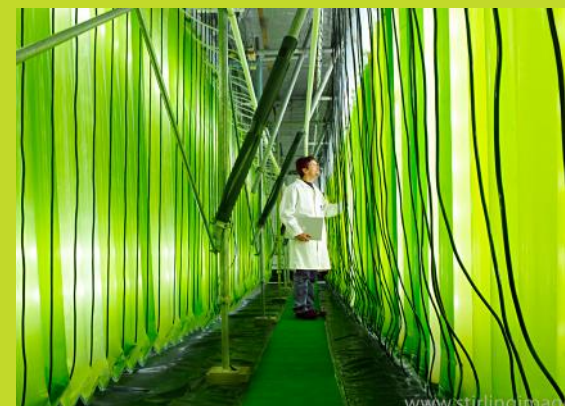
Cawthron scientist in Supreme Health's algae room

We've turned our location to our advantage with Air New Zealand's regional maintenance facility, employing hundreds of aviation experts; and HNZ choosing Nelson Tasman as its headquarters. With the country's fourth busiest airport, we have honed our aviation