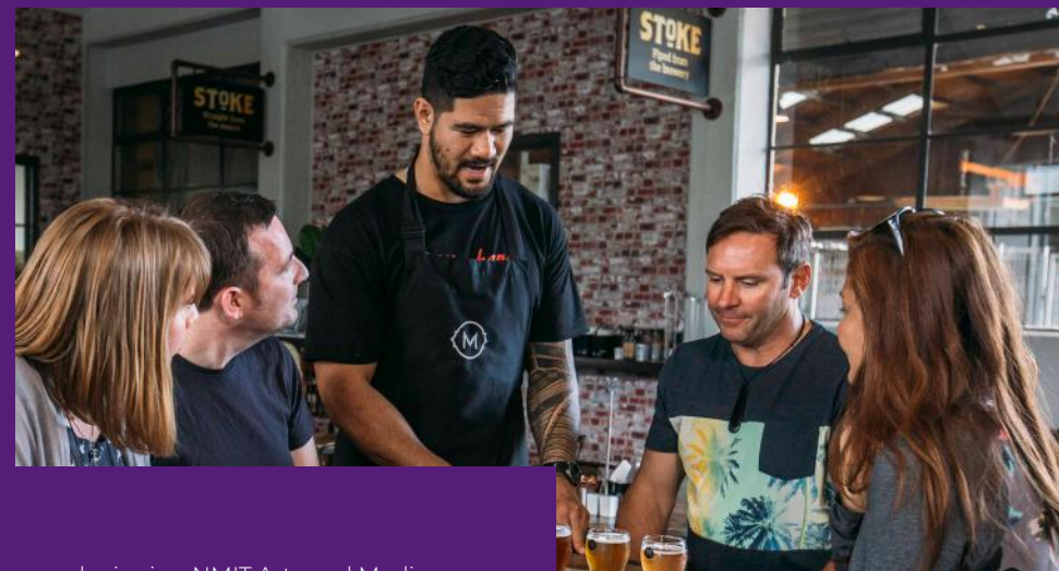
Craft beer tasting at McCashins Brewery

award-winning NMIT Arts and Media Building the first of its kind in the world, designed by Nelson architects.