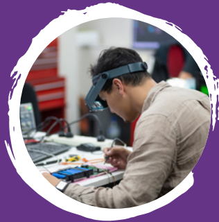
Science & Technology