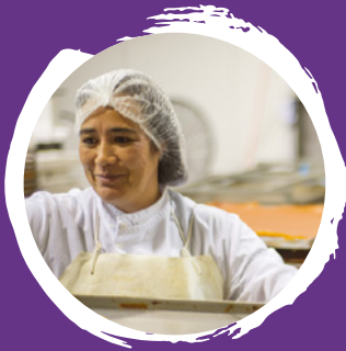
Horticulture/ Food & Beverage