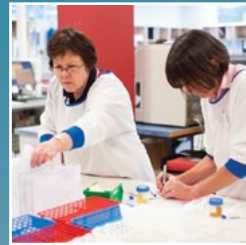
SCIENCE & TECHNOLOGY