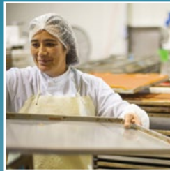
HORTICULTURE FOOD & BEVERAGE